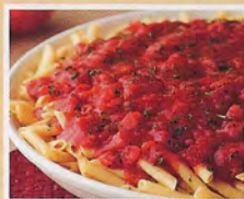
Penne with Spicy Marinara

OPTIONS TO ADD: Handmade Meatballs, Italian Sausage, Grilled Chicken or Fresh Vegetable Medley