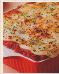
Homemade 16 Layer Lasagna

All entrées include 2 loaves of fresh-baked bread