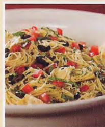
Angel Hair with Artichokes