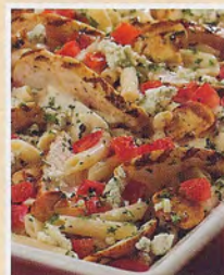
Chicken Penne Gorgonzola