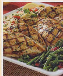
Lemon Rosemary Chicken