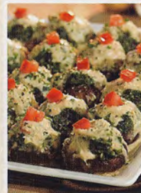
Baked Stuffed Mushrooms