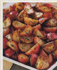
Roasted Rosemary Potatoes