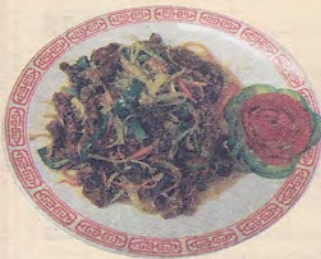
☞ Crispy Shredded Beef in Spicy Sauce