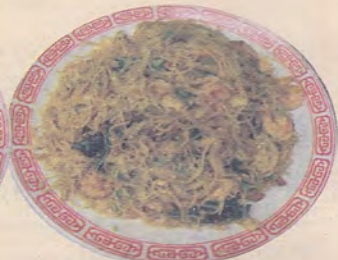
☞ Singapore Style Chow Mei Fun