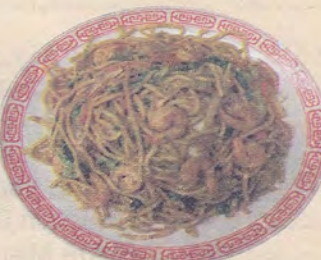
Shrimp Lo Mein