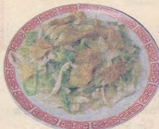
Chicken Chow Mein