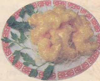
Bang Bang Shrimp