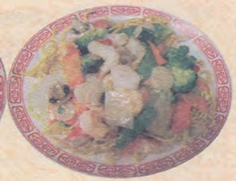
Seafood Pan Fried Noodle