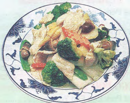
Mixed Vegetable Chicken