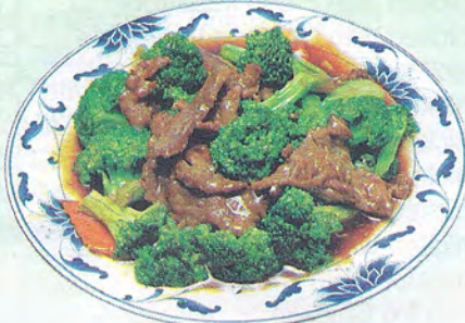
Chicken w. Broccoli