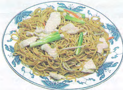
Chicken Lo Mein