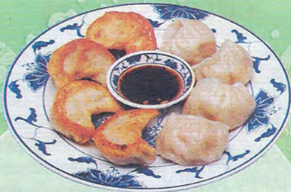
Fried or Steamed Dumpling