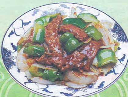
Pepper Steak w. Onion